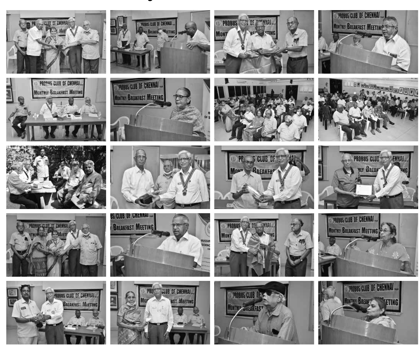
PROBUZZ... JUNE 2022 PAGE 6